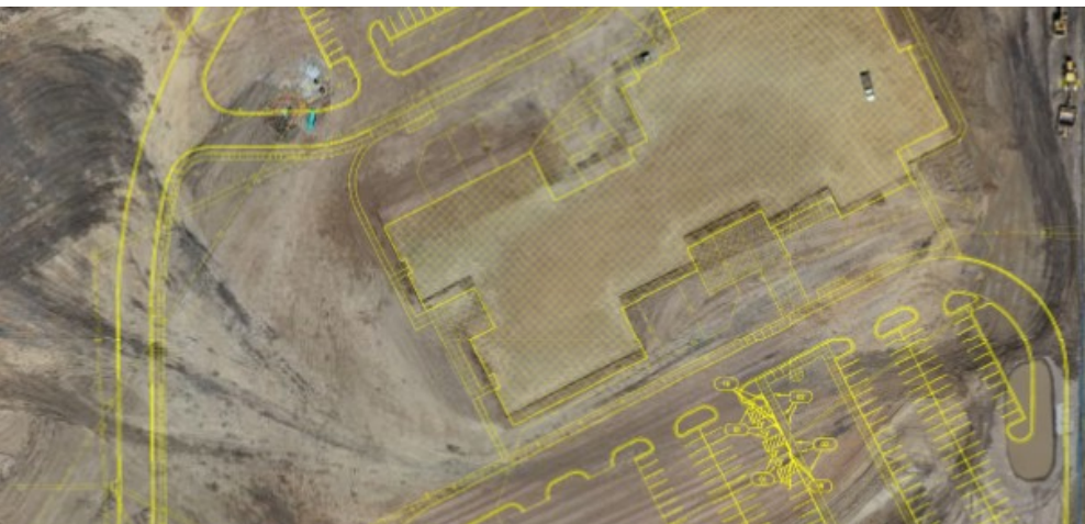
Project Site – Drone Footage