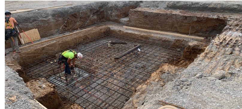
Elevator Footings Site Grading